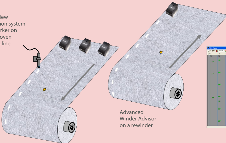
Advanced Winder Advisor on a rewinder